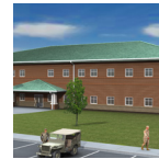
Training Facilities 2nd Brigade Combat Team Complex, Ft. Stewart, GA