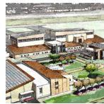
Hangars and Flightline Facilities AFSOC Campus, Yokota Air Base, Japan