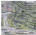
Entry Control Points Access Control Points (ACP) Planning Level Layouts, Adelphi Laboratory, MD