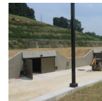
Munitions Facilities High Performance Magazine, NSA Crane, IN