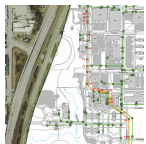
Civil/Infrastructure Great Lakes Naval Station Sanitary Sewers and Manholes