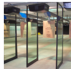
Firing Ranges US Customs Advanced Training Center and Firing Range, Harper's Ferry, WV