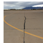
Airfields Planning Charrette Reports for 388th/419th Aprons, Hill AFB, UT