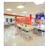
Dining Facilities IBCT Dining Facilities, Ft. Bliss, TX