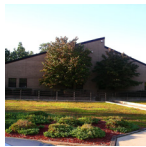
Headquarters Facilities ARSOAC Headquarters, Ft. Bragg, NC