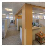
Administration Facilities Facility 30219, Wright-Patterson AFB, OH