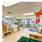
Child Development Centers Replica CDC, Ft. Bliss, TX