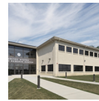
Reserve Centers Cleveland Army Reserve Center, Twinsburg, OH