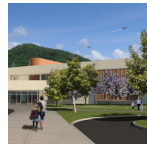
K-12 Educational Facilities Stearley Heights Elementary School, Kadena AB, Okinawa, Japan