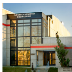
Laboratories & Research ElectroChemistry Engineering Facility, NSA Crane, IN