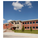
Barracks and Housing Starship Barracks Renovation and Dining Facilities, Ft. Jackson, SC