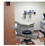
Medical Facilities Hill Air Force Base Medical Clinic, Hill AFB, UT