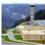
Correctional Facilities Big Sandy United States Penitentiary and Prison Camp, Inez, KY